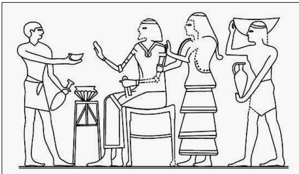
Figure (1) Shows details from the scene of Nebamun's tomb shows Syrian dignitary being given a medicine (after Strouhal, Vachala, and Vymazalova, The Medicine of the Ancient Egyptians , Fig. 2)

or the nearby vicinity [34]. Nebamun chose two scenes as focal points of his tomb. The scene on the north side evokes the visits of Syrian dignitaries and their entourage who traveled to Thebes and Nebamun's interaction with them in his role as chief physician in Thebes. The scene on the south side depicts an equally significant, making of medicines and inspection of his physician's workshop, again as the physician of the king in Thebes [34]. As the only New Kingdom tomb of a physician whose scenes actually depict aspects of his career, Nebamun's tomb (TT17) becomes an important source of information about the role and duties of the New Kingdom physicians and the only pictorial source that confirms the travel of foreigner patients to Egypt hoping for medical treatment. Another pictorial evidence is the scene of medical instruments depicted on the inner of enclosure wall of the temple of KomOmbo, fig. (2). Although later in times than the Dynastic Periods and does not really represent the Pharaonic instruments [1], it could be regarded as an evidence that these instruments were in use in the temple precinct or at least in its vicinity, which lead to suppose that some other earlier temples had similar instruments.